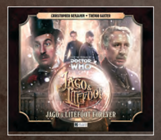
OUT THIS MONTH CD: £16.99, DOWNLOAD: £14.99 EXTRAS Bonus disc