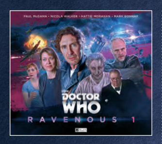
OUT THIS MONTH CD: £23.00, DOWNLOAD: £20.00 EXTRAS Bonus disc