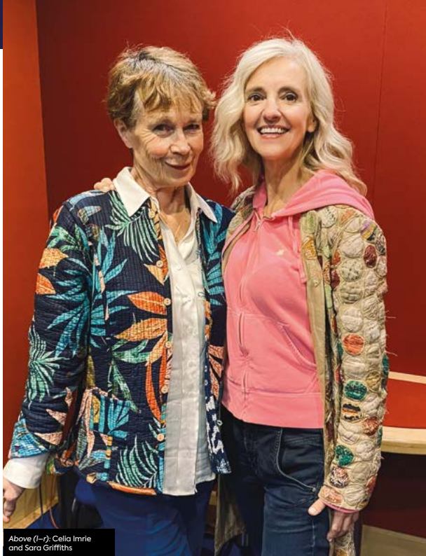
Above (l-r): Celia Imrie and Sara Griffiths