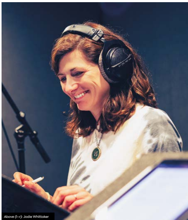
Above (l-r): Jodie Whittaker

simple. A UFO has crashed on the outskirts of Sheffield, however, this is during the era that UNIT was briefly decommissioned due to budget cuts, so the civilian authorities have to deal with the situation on their own. Fortunately, they have one or two officers with relevant experience..."