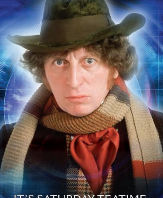
IT'S SATURDAY TEATIME IN 1977 ALL OVER AGAIN!