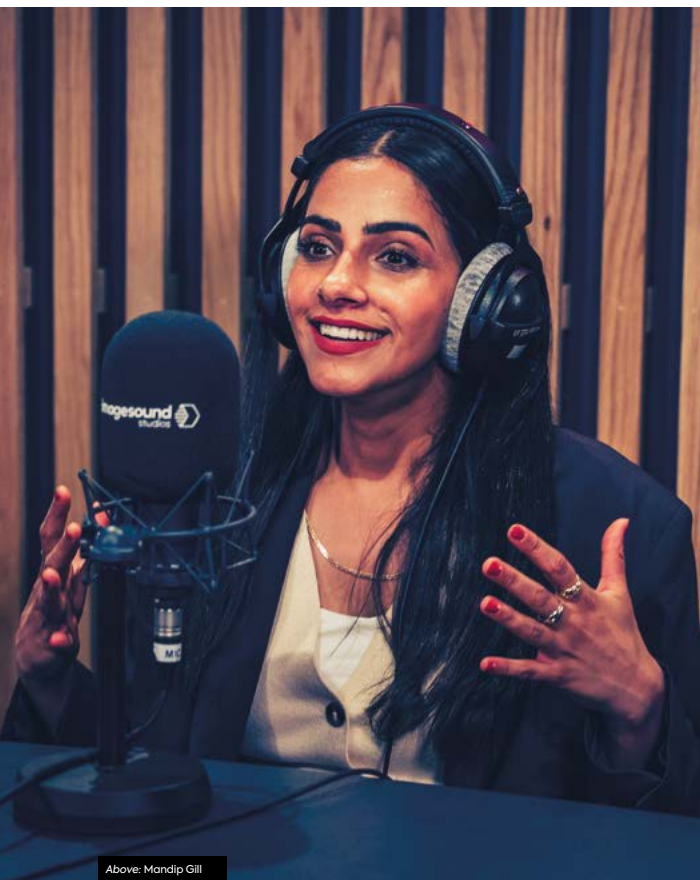
Above: Mandip Gill

and the creation of weapons. I also wrote a theme for the Tourist, which was gratifying for me, as it gave me a chance to reflect on this character's qualities in a musical setting."